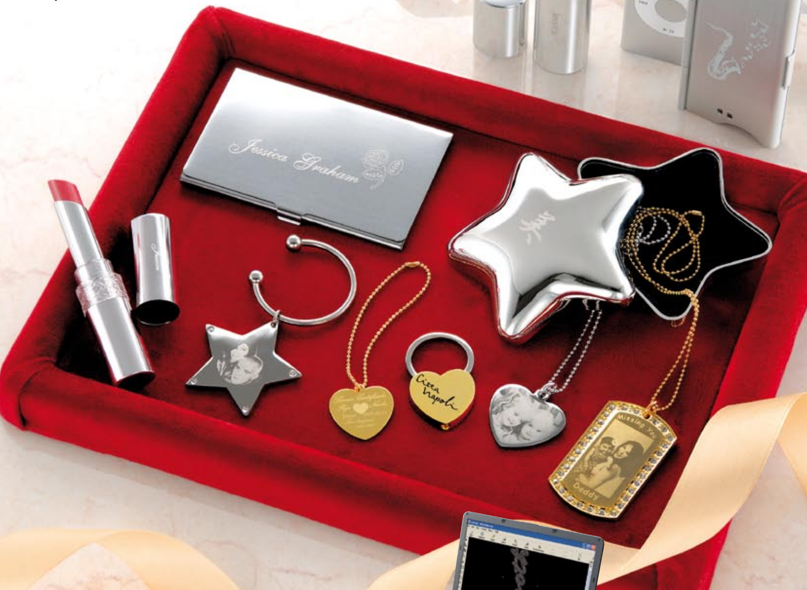
PHOTO IMPACT PRINTER METAZA MPX-80

T he MPX-80 Photo Impact Printer quickly turns ordinary gifts and promotional items into cherished mementos. Create individualized gifts for any special occasion, from weddings and anniversaries to birthdays and graduations. Produce one-of-a-kind jewelry featuring family photos of children and pets. Add impact to business events with unique personalized awards.